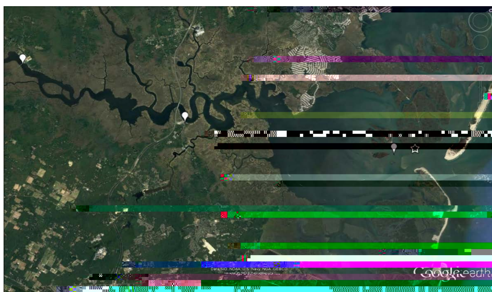
Figure 1. Map of the study area, the Mullica River–Great Bay Estuary. JCNERR collected temperature data from Lower Bank, Chestnut Neck and Buoy 126. B. chrysoura and T. adspersus were obtained from RUMFS.