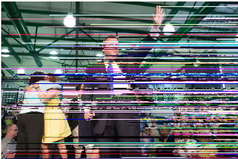
Chris Christie in 2016 when he announced his first presidential run.

Updated: Jun. 06, 2023, 12:51 p.m. | Published: Jun. 06, 2023, 8:30 a.m.