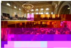
GALLERY: Christie touts his record, offers few new ideas