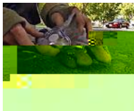
Do Not Miss These Viral Videos From 2013