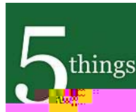
Five Things to Know From Monday's Council Meeting