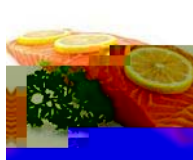
Is there a Difference between Smoked Salmon and Frozen?