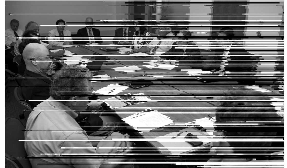
Advisory Board Chairman, Constantelos Hellenic Collection and Reading Room