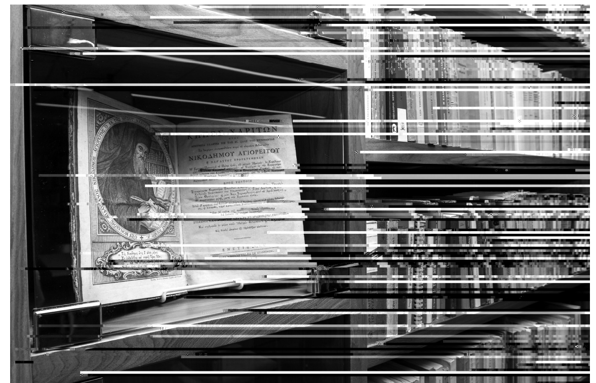
One of the many valuable books featured in the collection.